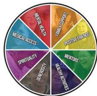
Sources of Strength